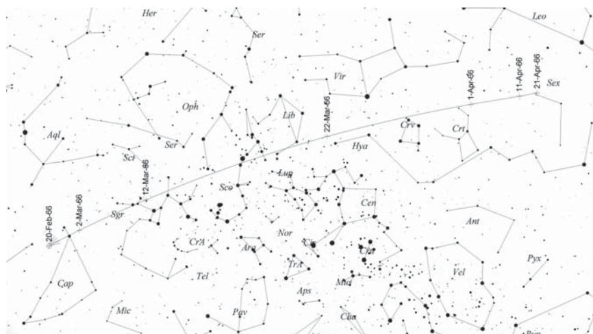
Figure 2. Path of Halley’s Comet in AD 66 ( SkyMap Pro ).

The estimated apparent magnitude of the comet during its period of visibility is given in Figure 3. The figure also shows the period each day, assuming a sufficiently cloudless sky, when the comet was visible from Jerusalem. To determine an