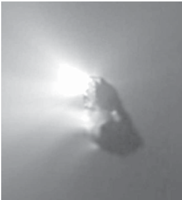
Figure 6. The heart of the Star of Bethlehem?

astrologically significant is not ruled out as the basis of any such oral stories. What is ruled out is any causal relationship between such an event and the birth of Christ.